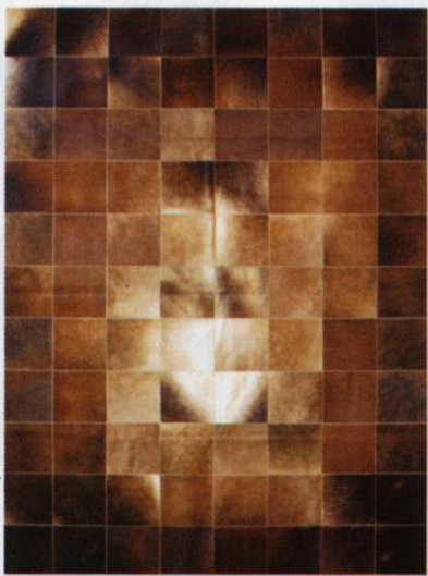
PARK RUG | NORMAND